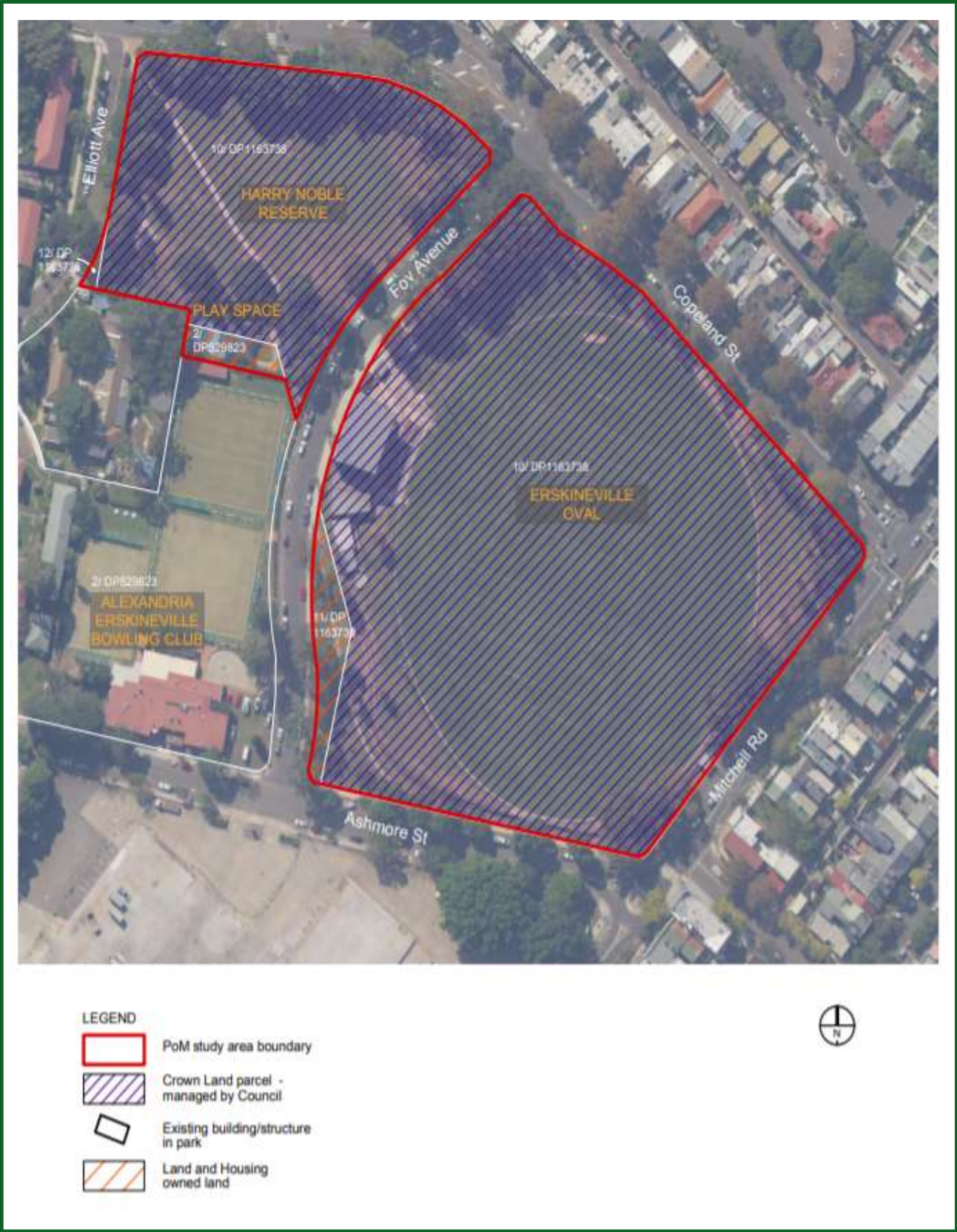
Figure 2. Site Plan