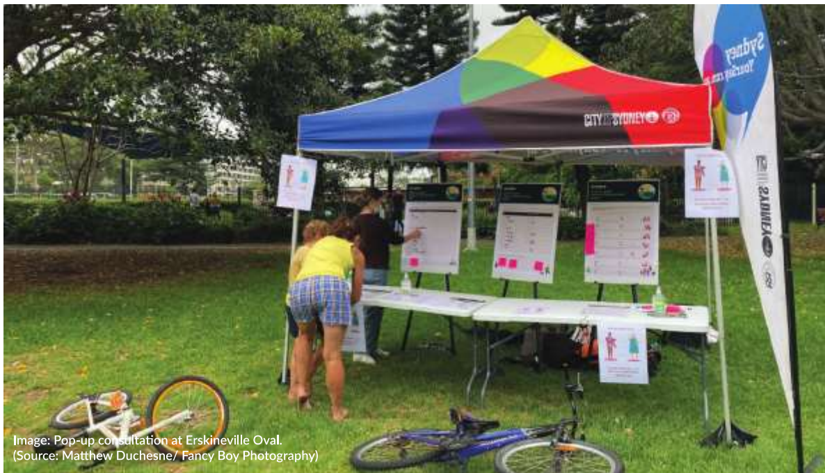
Image: Pop-up consultation at Erskineville Oval.