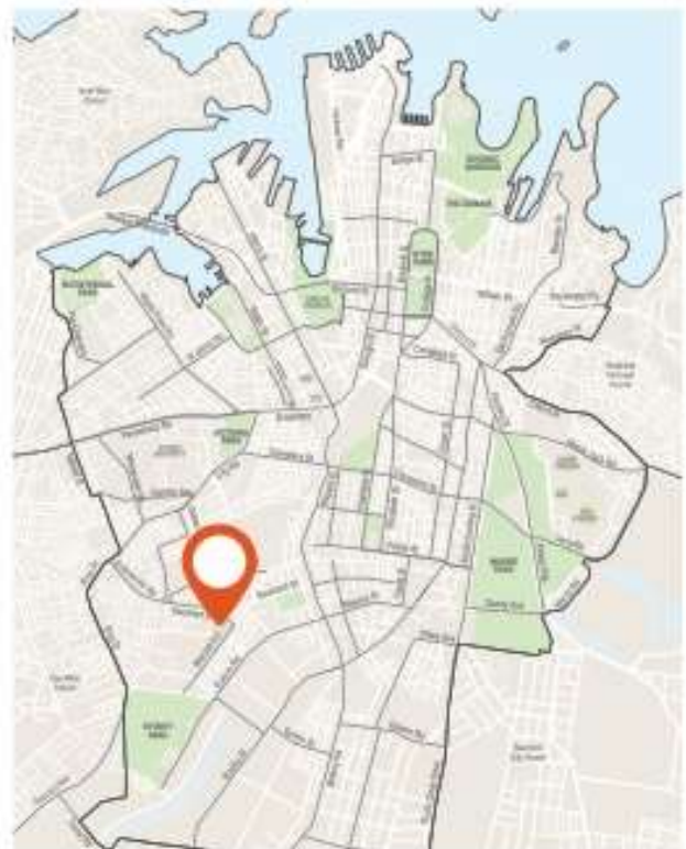
Erskineville Oval and Harry Noble Reserve, Erskineville