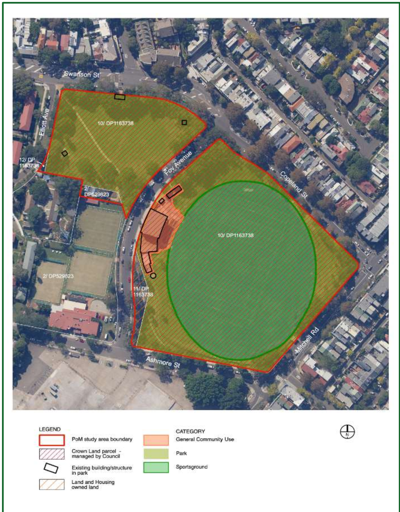
Figure 3. Community land categorisation map